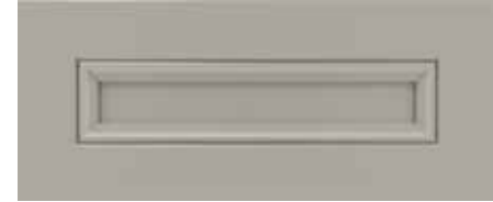
Optional 5-Piece Drawer Front