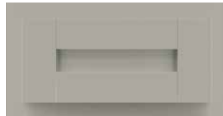
Optional 5-Piece Drawer Front